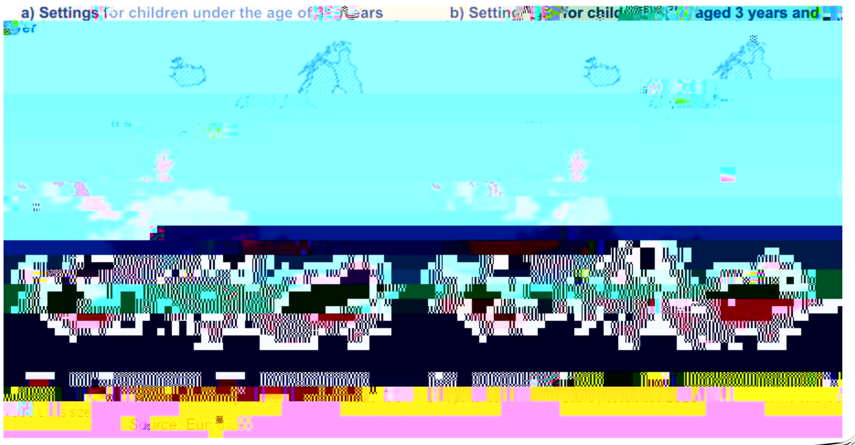
Figure A7: Significance of private self-financing centre-based ECEC provision, 2018/19